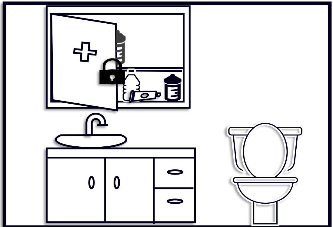
Room 2: Bathroom